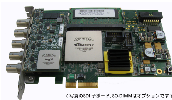
(写真のSDI 子ボード, SO-DIMMはオプションです)