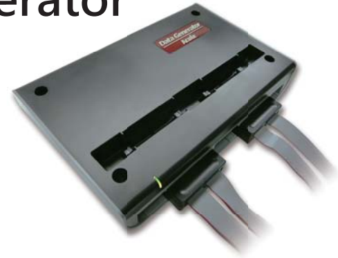
270 x 175 x 55 (mm 3 )